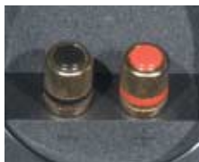
Five-way binding posts provide secure connection and easy setup.

Sound that commands your focused, undivided attention, transforming the act of listening from a passive pursuit to an engaging endeavor. That's the heritage of Infinity — and the promise of Primus.