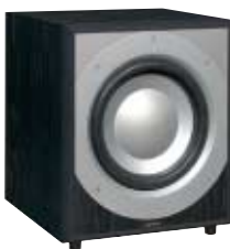
Add the PS-8, PS-10 or PS-12 powered subwoofer for incredible music and home theater realism.

From unobtrusive bookshelf music systems to dazzlingly powerful home theaters, there's a Primus system that's right for every purpose and room in your home. Infinity also offers three powered subwoofers to perfectly complement your Primus speakers. A recommended addition to any system, these three subs allow you to duplicate the cinematic experience at home.