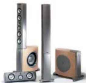
Infinity's flagship system, the Prelude MTS.

Primus Series speakers benefit from every Infinity innovation that has ever come before. They also embody everything we've learned about making captivating sound affordable.